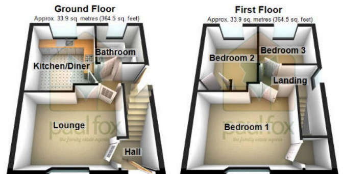
Total area: approx. 67.7 sq. metres (729.1 sq. feet)